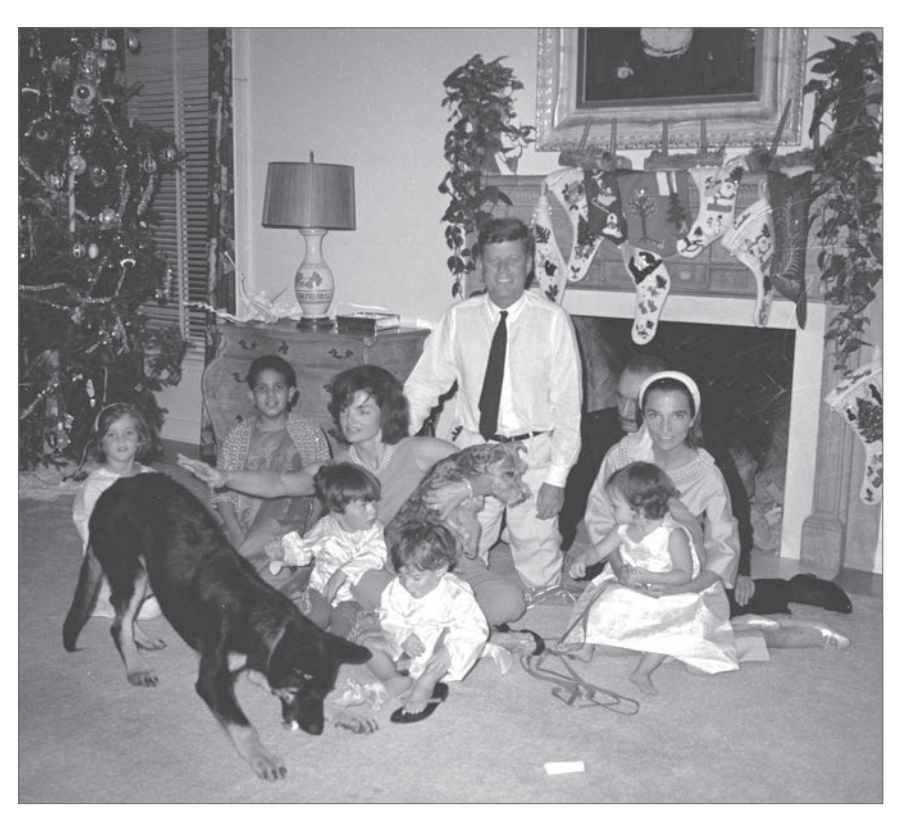
The Kennedys with Jackie's sister's family, Christmas Eve, 1962. The black dog is Clipper. Mrs. Kennedy is holding Charlie.

parking lot. If a war had started, buses would take us to an underground bunker.